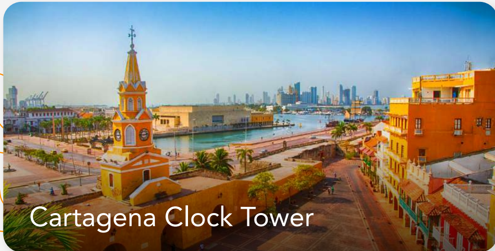
Cartagena Clock Tower