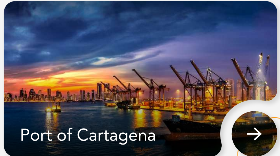
Port of Cartagena