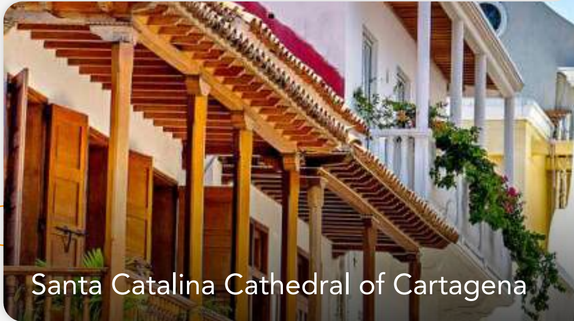
Santa Catalina Cathedral of Cartagena